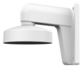
DS-1272ZJ-110-TRS Wall Mounting Bracket